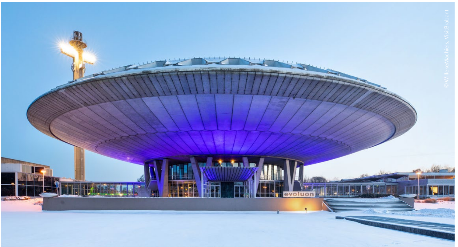
Evoluon in Eindhoven