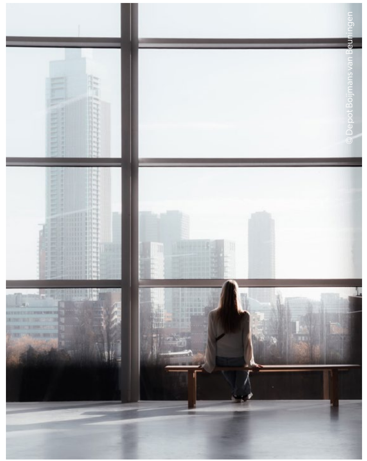
Depot Boijmans van Beuningen